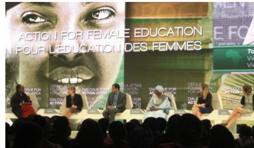
Forum on Women's and girls' education

In June 2012, MEWC took part in the first "Dialogue for Action Africa" which took place on June 11, 2012 in Libreville, Gabon. In association with Mrs. Sylvia Bongo Ondimba, First Lady of Gabon, this day-long dialogue was to provide a global platform for NGOs, academics, business leaders, and officials dedicated to resolving Africa's greatest challenges for women and to enable them to share their inspirations and visions to work together to make a Plan of Action for Africa.