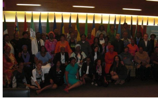
Participants at the "African Diaspora Dialogue on Women and Youth Summit"

In May 2012, MEWC took part in the "African Diaspora Dialogue on Women and Youth Summit" held in Pretoria, South Africa. The event brought together the representatives of Women and Youth organizations and networks working on women and youth development issues, prior to the Ministerial Meeting and the Global African Summit of Heads of State and Government, at a Women and Youth Global African Diaspora Dialogue.